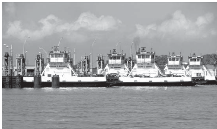
We loved looking at the Fairy Boats!