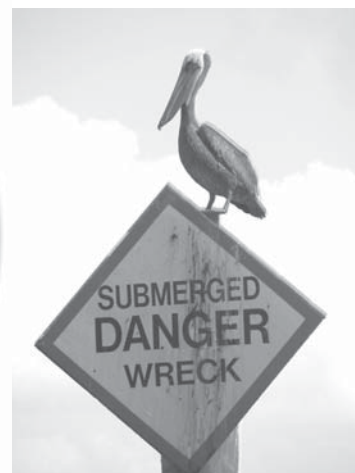
This Bird does not seem to be too worried!!!!